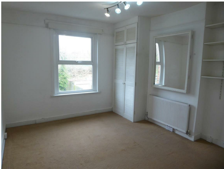
Rear aspect double glazed window, radiator, built-in cupboard with storage above.