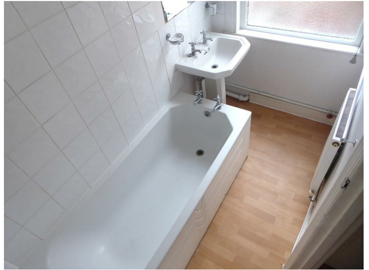
White suite comprising panel enclosed bath with wall mounted shower unit, pedestal wash hand basin, radiator, part tiled walls, side aspect double glazed frosted window.