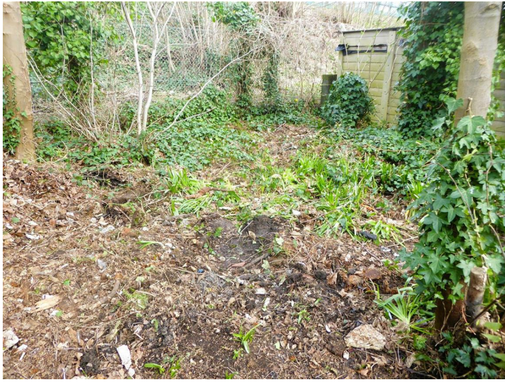
Outside area to the rear, off street parking space to the front.