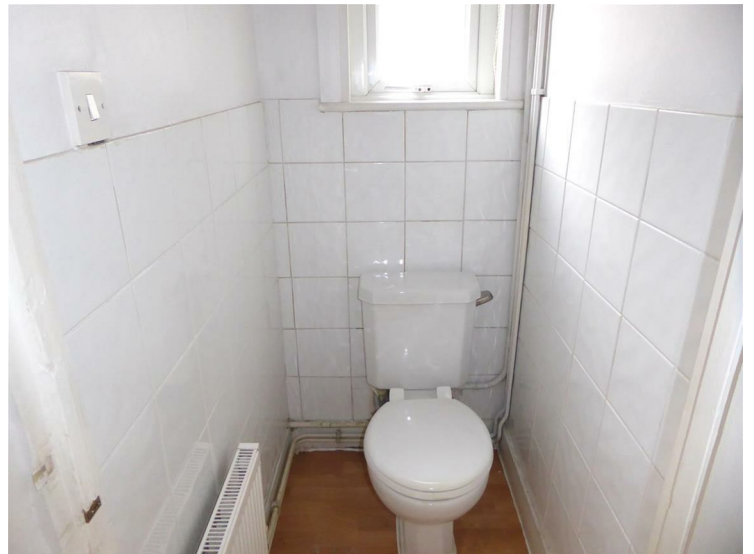
Low level w/c, part tiled walls, double glazed window.