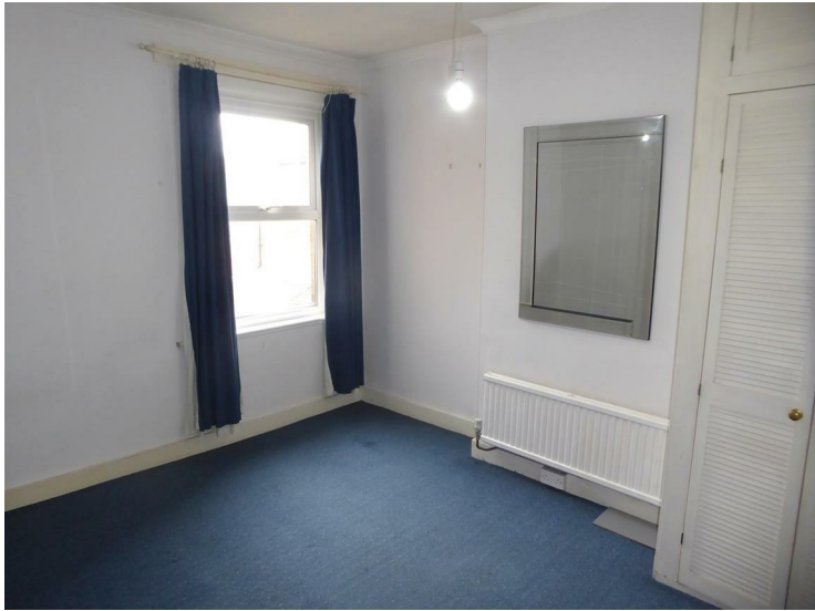
Rear aspect double glazed window, radiator, built-in cupboard.